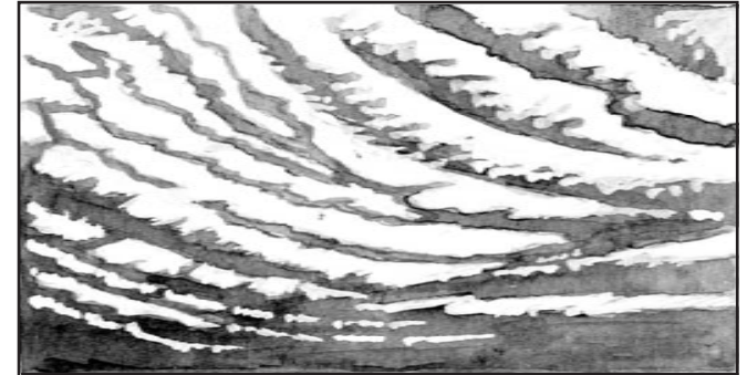
Stratus: Clouds stretching out in layers.