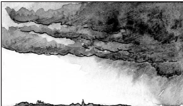
Altus: Clouds found at a high altitude.