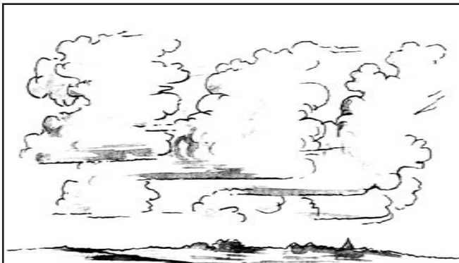
Nimbus: Rain-bearing clouds.