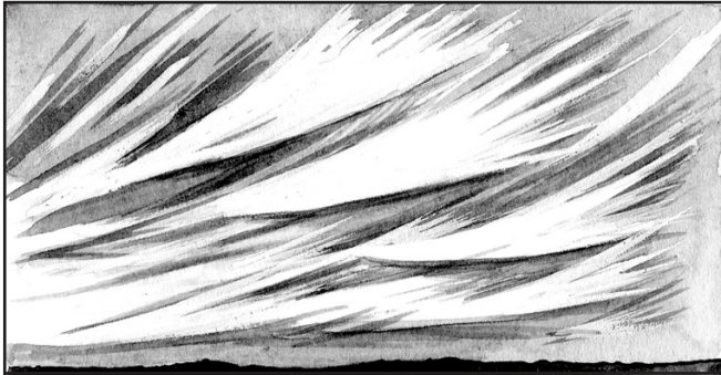
Cirrus: Thin, wispy clouds formed from ice crystals and usually high up.