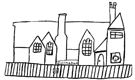
Ellingham VC Primary School